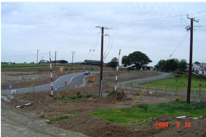
Temporary Road Diversion at Castleblaney Road (N53)

It is planned to have all these works completed in February 2005.