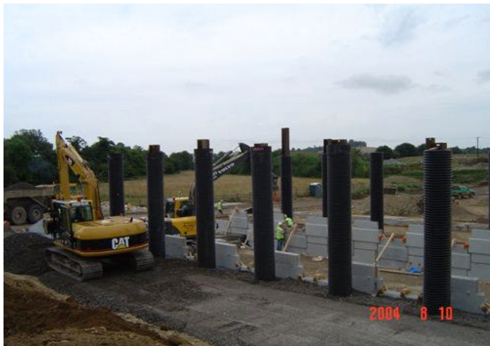
Reinforced Earth Abutments under Construction at Scotch Green Road Underbridge

Following on from our newsletter in May of this year, the construction works on the Dundalk Western By-Pass have progressed well. Our construction contractor who is a joint venture company between Ireland's and Europe's foremost civil engineering contractors Ascon Ltd., Dragados and Edmund Nuttall Ltd. have taken full advantage of the favourable weather conditions which allowed them to make significant progress. We are now, six months into the construction phase of the Dundalk Western By-Pass. Progress is on target to deliver it's completion in Feb 2006. Below we give a brief update on construction progress by location.