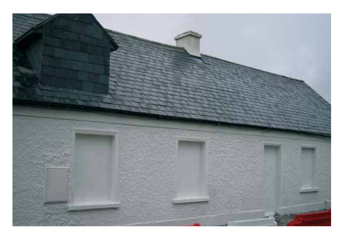
Figure 4: Example of a Bat Roost at Knockanean, County Clare

While a number of designs exist for bat houses, a building with an external structure in keeping with the surrounding architecture may be appropriate. The structure should be endorsed by the NPWS and by specialists with experience in the construction of buildings for bats to ensure that it has the right conditions to satisfy the requirements of the impacted species.