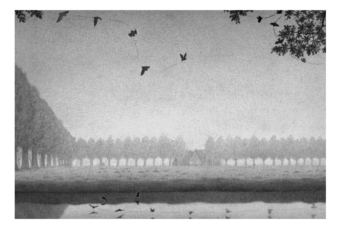
Figure 1: Hunting behaviour of three bat species

prey in areas that have good vegetation cover, including mature trees (woodland or forestry), hedgerow and scrub. They also frequently feed close to water as wetlands tend to support large insect communities. Bats fly along hedgerows and woodland edges as well as small lanes, minor roads and waterways, both to find and catch food and to commute between feeding areas and roosts and between alternative roosts. Good vegetative cover for bats is important and essential for much of their ecological requirements. Woodland is a highly beneficial habitat for bats and the colony sizes of species such as the lesser horseshoe bat is positively correlated with surrounding woodland size (Reiter, 2002). Hedgerows along roads may serve as an extension of woodland edge.