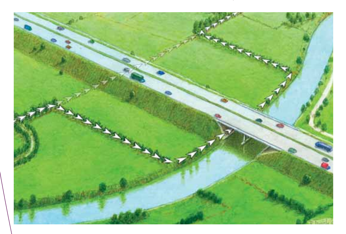
Figure 3: A spacious spanning of a watercourse with a bridge offers bats good possibilities to cross the road safely. Original hedgerows or tree lines can be rerouted to such a point

The incorporation of a carefully designed underpass will also allow bats to gain access to either side of the road. This may range in size from a 1.5m concrete pipe or box culvert up to a 4m wide structure. In some situations, bats routes can be redirected to allow them to pass under certain watercourse crossings (Figure 3). The value of the smaller pipes has yet to be proven but larger culverts have been recorded as being widely used by most bat species.