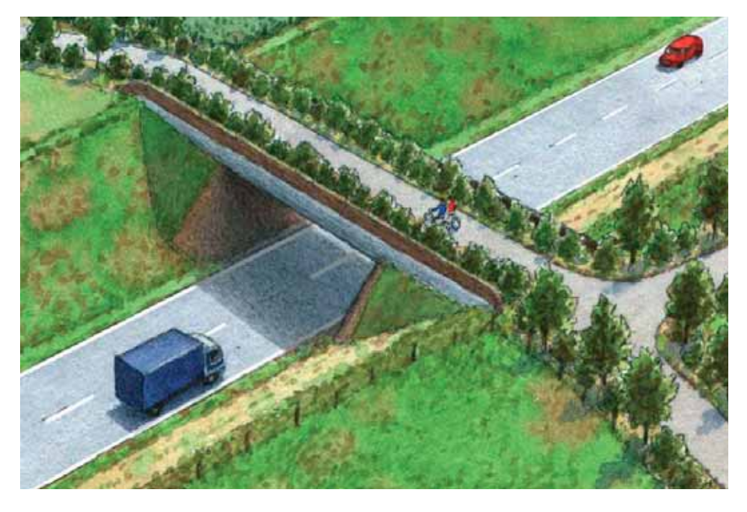
Figure 2: A 'green bridge' planted with trees has proven useful in guiding bats over roads

The incorporation of a carefully designed underpass will also allow bats to gain access to either side of the road. This may range in size from a 1.5m concrete pipe or box culvert up to a 4m wide structure. In some situations, bats routes can be redirected to allow them to pass under certain watercourse crossings (Figure 3). The value of the smaller pipes has yet to be proven but larger culverts have been recorded as being widely used by most bat species.