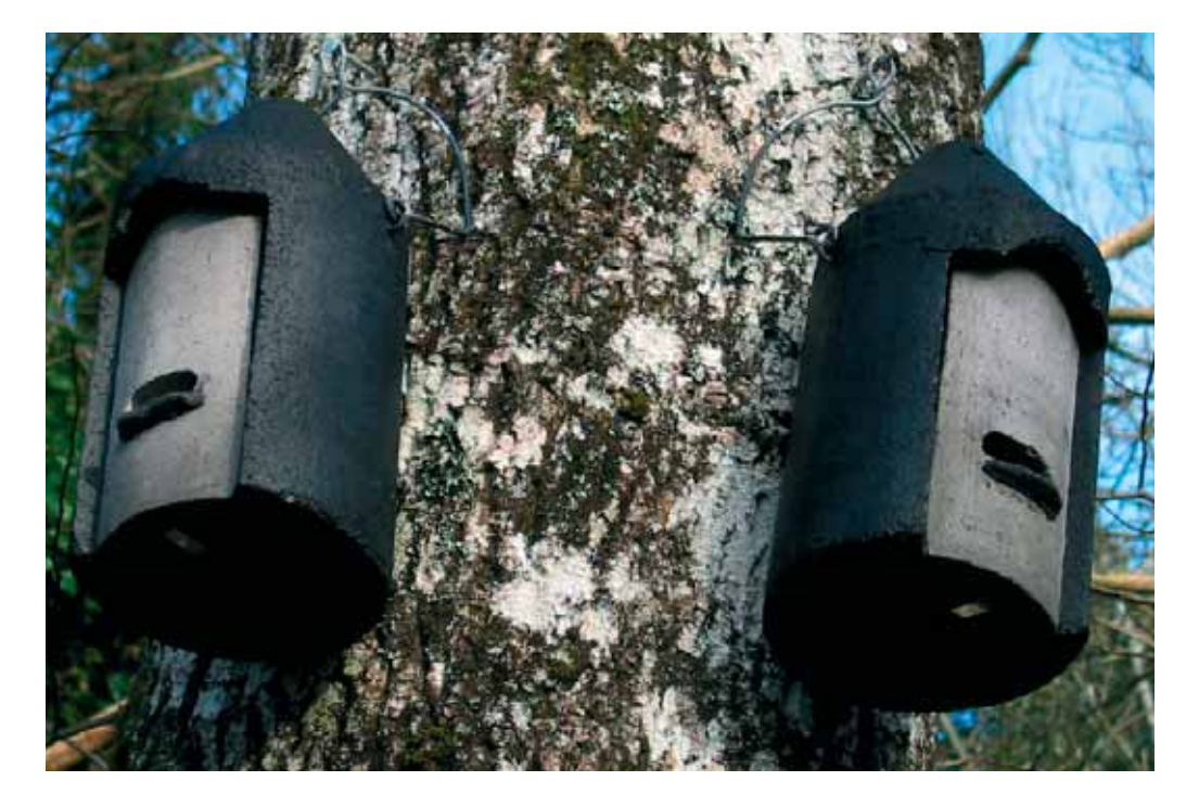
Figure 5: Example of bat boxes - Schwegler Woodcrete bat boxes - SE and SW aspect

Materials used for the construction of bat boxes range from traditional timber boxes to 'Woodcrete' boxes. Timber boxes are made from untreated (free from chemical treatment) rough softwood. 'Woodcrete' boxes are made from a mixture of concrete, sawdust and clay molded into a specified shape (Figure 5). 'Woodcrete' boxes have the advantage of allowing natural respiration, stable temperature and greater durability while black colouring attracts sunlight.