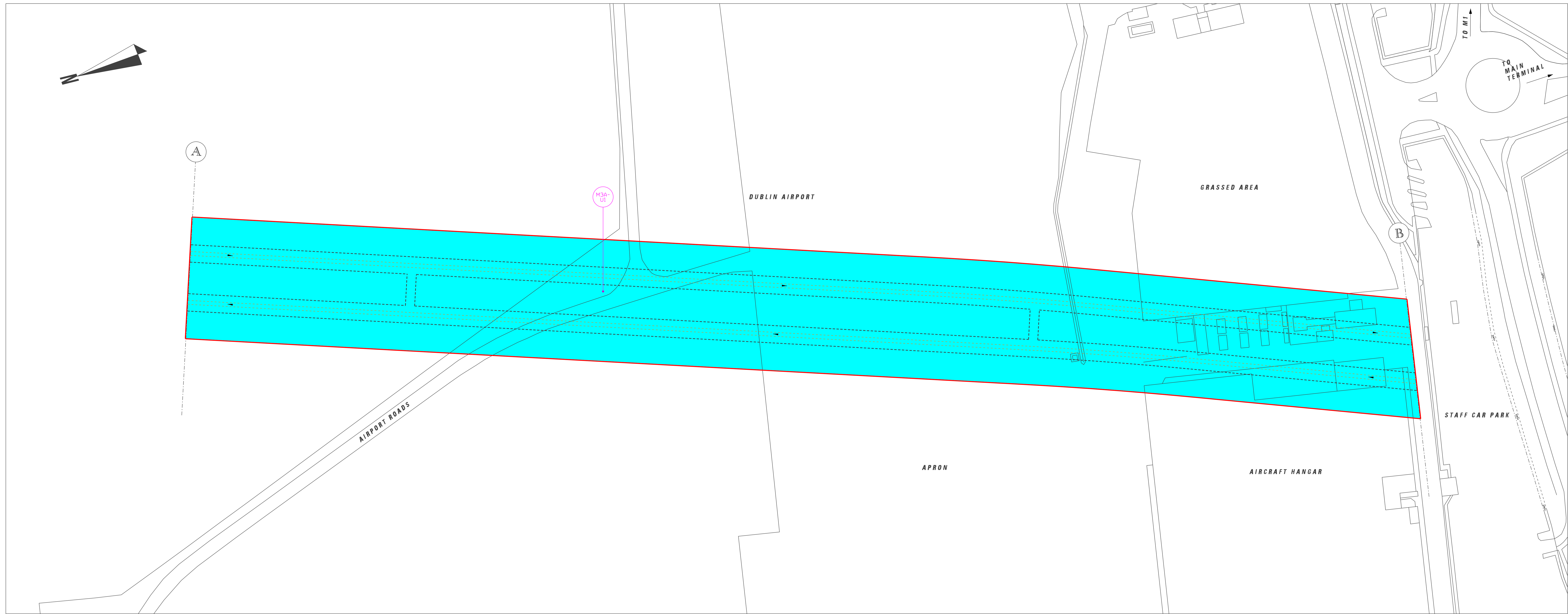
LOCATION PLAN Scale 1 : 500