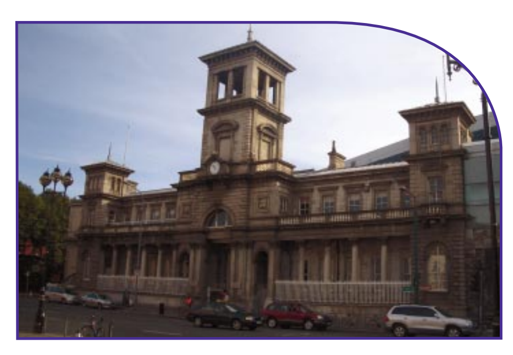
Connolly Station (front)

There are no predicted operation impacts associated with cultural heritage other than the appearance of wires (and their associated fixings) on a number of buildings which is considered a marginal impact.