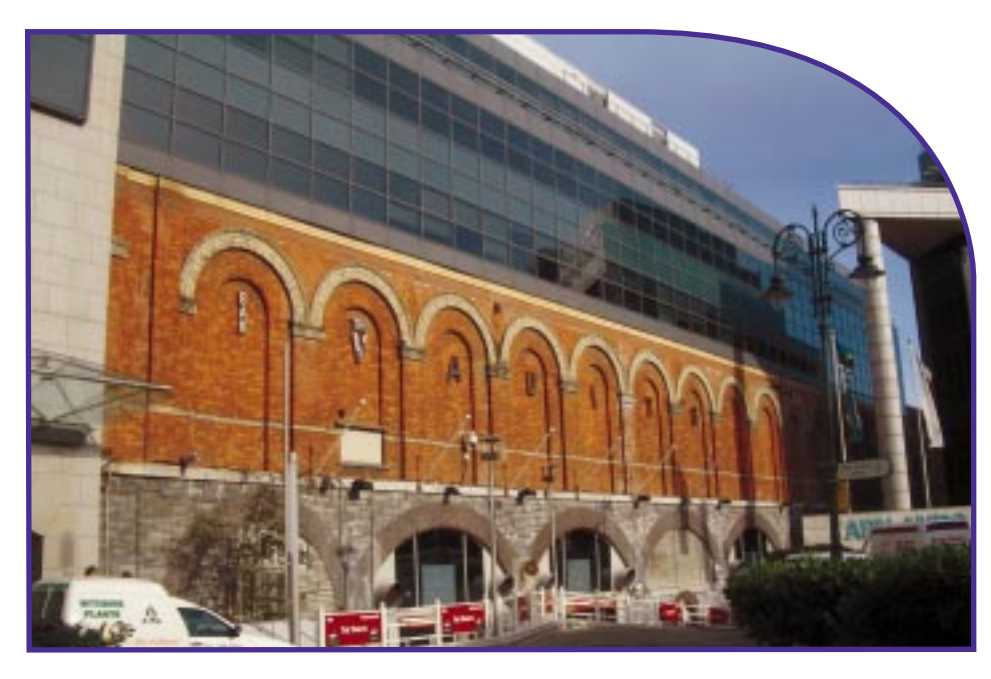
Connolly Station (rear)