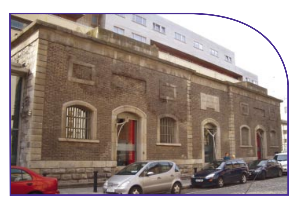
Former Excise Building