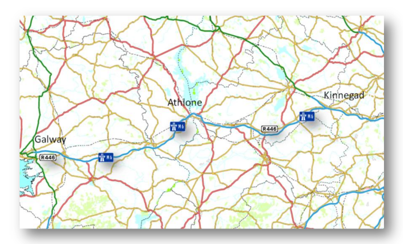
Figure 5-2: M6 Kinnegad to Galway

Reassignment of traffic from the old N6 accounts for 68% (6,500 AADT) of the demand on the M6. Assuming no growth between 2008 and 2010, this indicates an induced demand of 32% or 3,000 AADT.