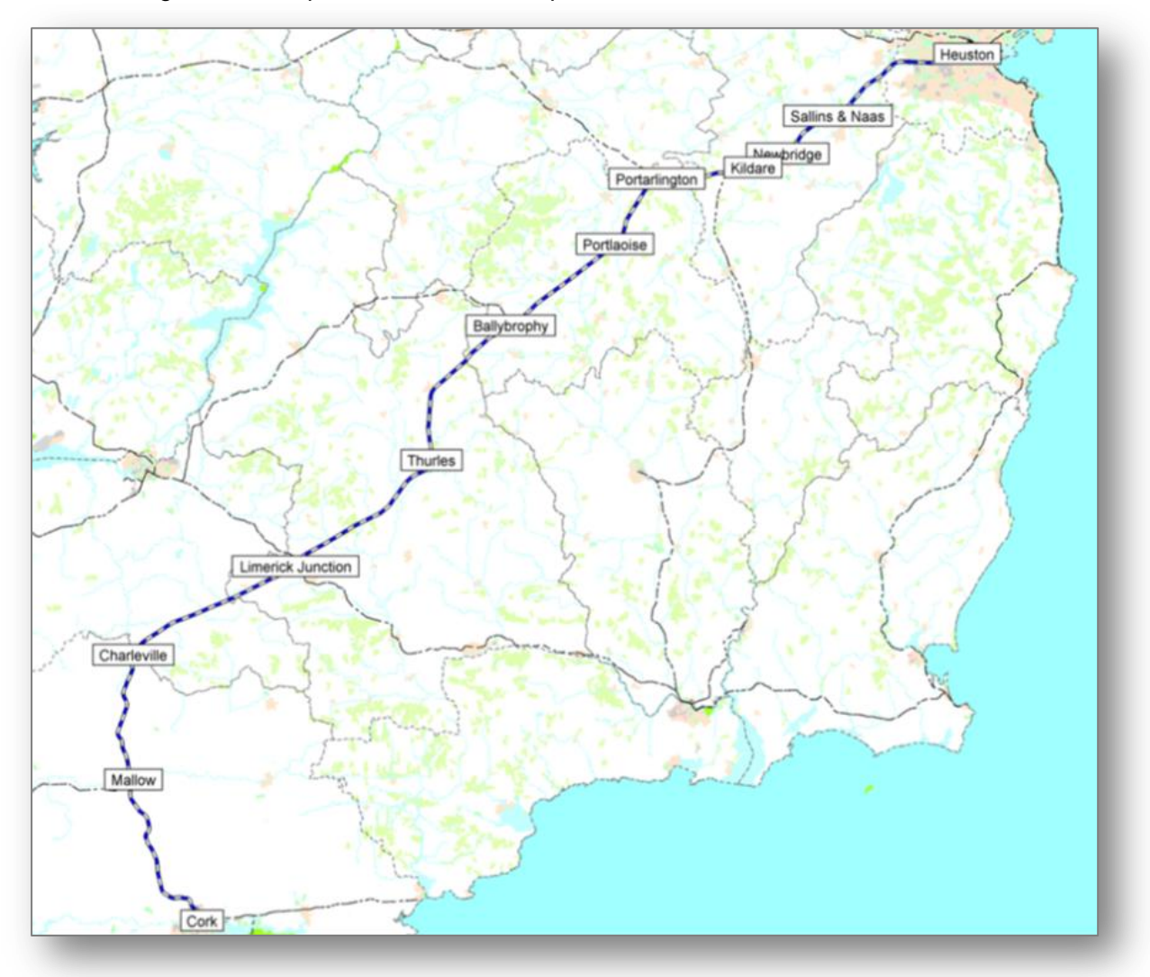
Figure 5-3: Dublin to Cork Rail Corridor

Reviewing broader research evidence on rail demand elasticities (from the UK Passenger Demand Forecasting Handbook), the scale of change in demand that can be attributed directly to the change in service provision would be expected to be between 50% to 75%.