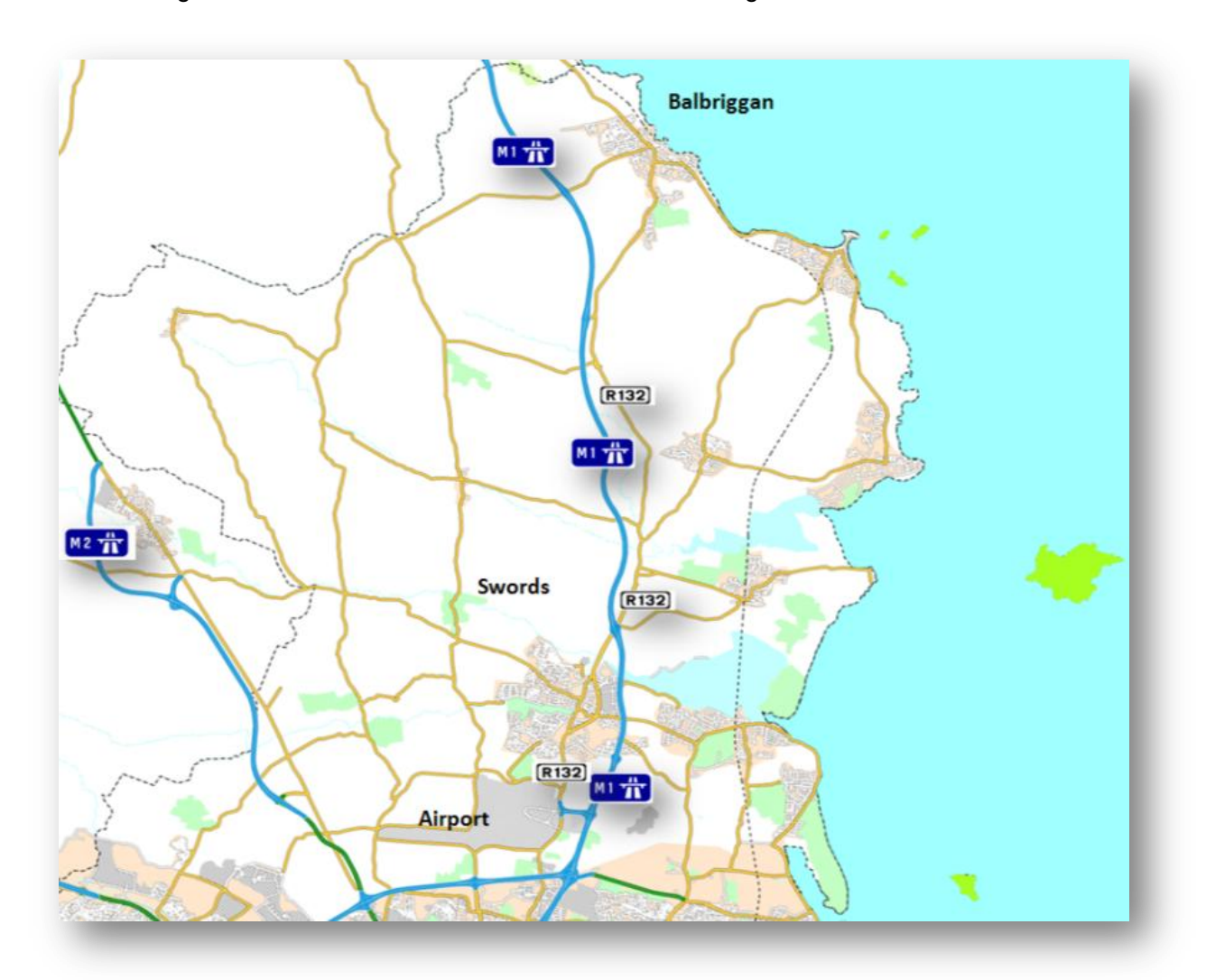
Figure 5-1: M1 Airport to Balbriggan

The AADT on the M1 in 2008 was 80,000 - this indicates a growth of 51% on the M1 between 2004-2008. At a national level traffic growth between 2004-2004 was 16%, which indicates additional demand of 35% on the M1 over this period. This will reflect traffic induced by the scheme together with differences between local and national growth rates.